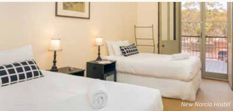
New Norcia Hostel

Our catering department provides good quality meals for residential groups, tour groups or private functions. The Hostel now hosts special dinners such as 'The Abbot's Table', high teas, and musical soirées, which include special tours, cocktails and gourmet food.