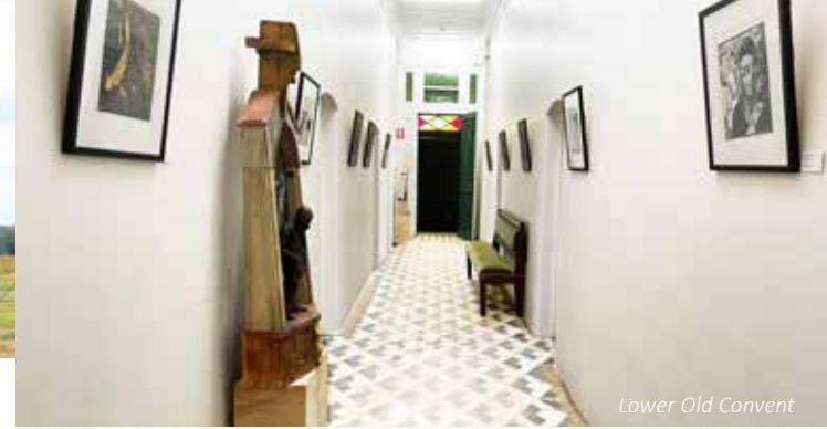
Lower Old Convent

Influenced the Byzantine era, the architecture of this building (established in 1913) is particularly impressive. The college offers accommodation for adult groups of 30 - 80 people, with carpeted open dormitories and separate male/female shared modern bathroom facilities. There is a variety of meeting spaces including interior courtyards, a large hall with a stage. Meals are served by New Norcia's Catering Service in the large dining room, which seats 100 people. In addition, there are courtyards, a large hall and a dining room which seats 30 for smaller groups.