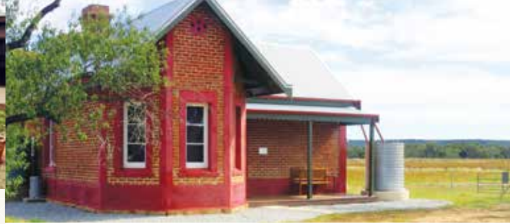
Above: Guesthouse Hermitage