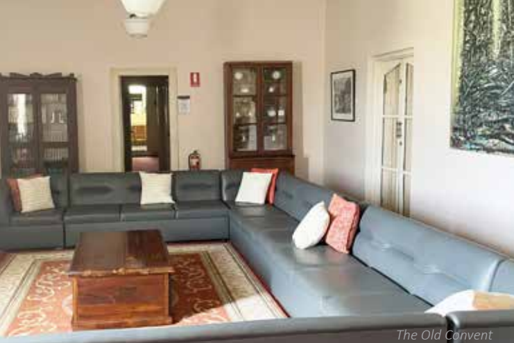
The Old Convent