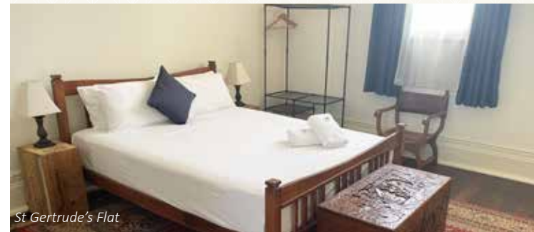
St Gertrude's Flat

Gothic revival in style, this beautiful building originally opened in 1908 as a girls' boarding school. St Gertrude's College offers dormitory accommodation for adult groups from 30 - 53 people, with carpeted floors and separate male/female shared modern bathroom facilities. Some areas include private cubicles. Groups can access two large halls within the building and other meeting and performance spaces. Smaller groups can also be accommodated in the newly renovated 'St Gertrude's Flat', which includes four double rooms (one downstairs with a large ensuite including disabled facilities, and three upstairs with a tea room), freshly painted large bathroom, spacious lounge and dining rooms boasting period furniture and features, a bright country style kitchen with optional self-catering facilities, and a secluded upstairs veranda.