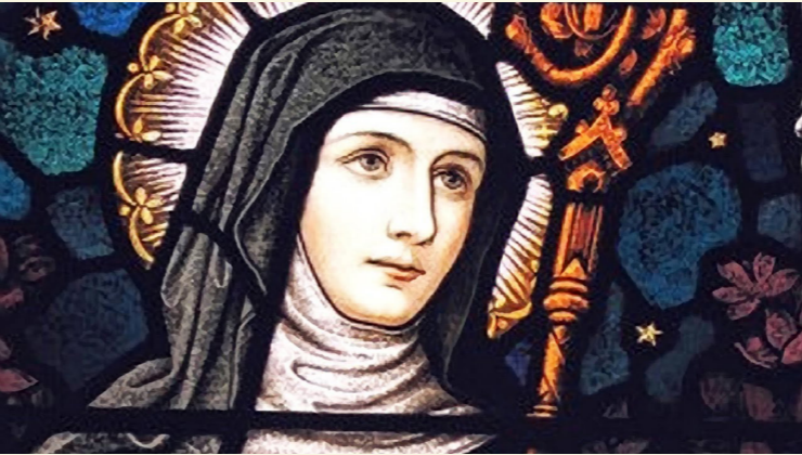
Above: An image of St Gertrude the Great

While monasteries and convents of Benedictine nuns flourished throughout Europe during the entire Middle Ages, the amount of writings left to us, in comparison with male Benedictines of the same period, is relatively small. Yet among these writings are many treasures, expressing the life of mystical prayer, remarkable visions and revelations, and an ardent love for God. This weekend will examine the remarkable lives and writings of four mediaeval Benedictine mystics; Hildegard, Elizabeth of Schonae, Gertrude the Great, and Mechtile of Hackeborn.