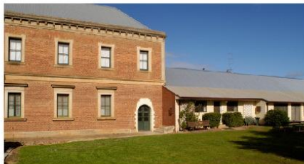
The Old Convent