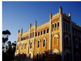
St Ildephonsus' College