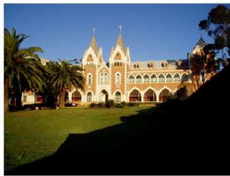
St Gertrude's College