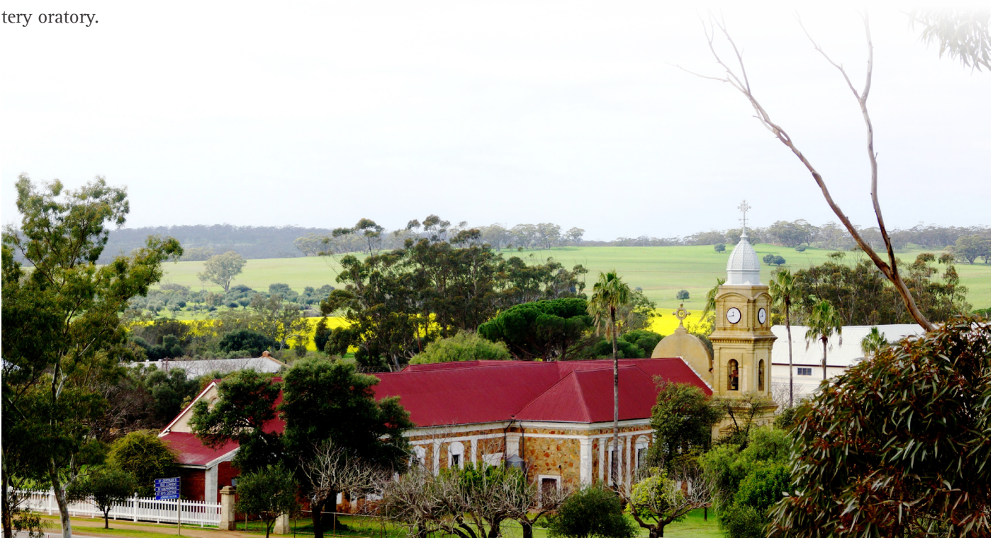
The Abbey Church at New Norcia, built 1861, renovated 1908.

While history, culture and a powerhouse of photo ops are its prime appeal, New Norcia also holds sway for spiritual seekers. A stay in the Monastery Guesthouse will get you close to the lives of the monks and their daily cycle of work, study and prayer. The Institute of Benedictine Studies holds regular retreats on spiritual topics from the Benedictine Experience to the Female Benedictine Mystics of the Middle Ages. Reading material abounds in the Guesthouse Reading Room, but maybe a quiet walk along the river to the iconic apiary is enough to get you close to the source. There's even a hermitage available to hire for some serious solo time-out.