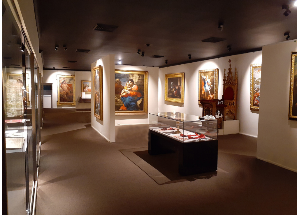
The extensive collection of artwork at the Museum & Art Gallery, New Norcia.

Today the marvel of New Norcia is enjoyed through tours, either the twice daily guided tours – which gets you inside to view the buildings' hidden treasures, including the resplendent college chapels – or a leisurely self-guided tour with the freely available Town Map in hand. Interpretive signs throughout the town tell stories of the early settlers, the history of their mission and educational enterprise, and the daily life of a Benedictine monk. You can even join the monks during one of their six daily prayers in the monastery oratory.