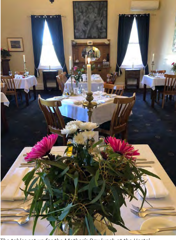
The tables set up for the Mother's Day lunch at the Hostel

New Norcia is excited to host Music of the Roaring 20's in mid-June, with fun, music and food of the 1920's in the New Norcia Hostel - which was fittingly built in the 1920's - as well as a Chinese themed dinner in July. More information regarding our events and to purchase a ticket, please visit our webshop at www.newnorcia.wa.edu.au.