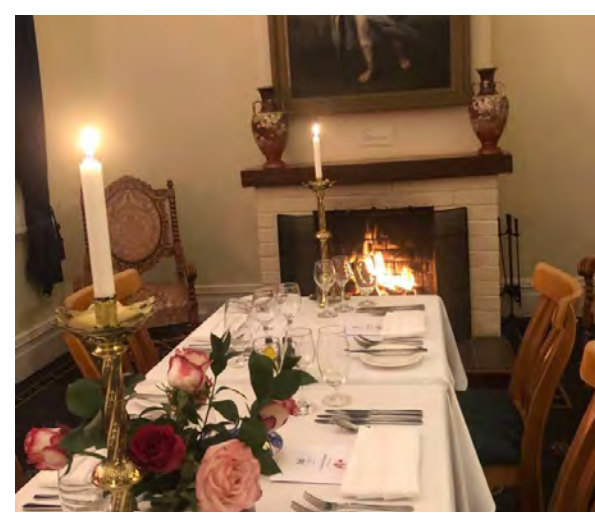
The fire was roaring during the recent Abbot's Table Dinner