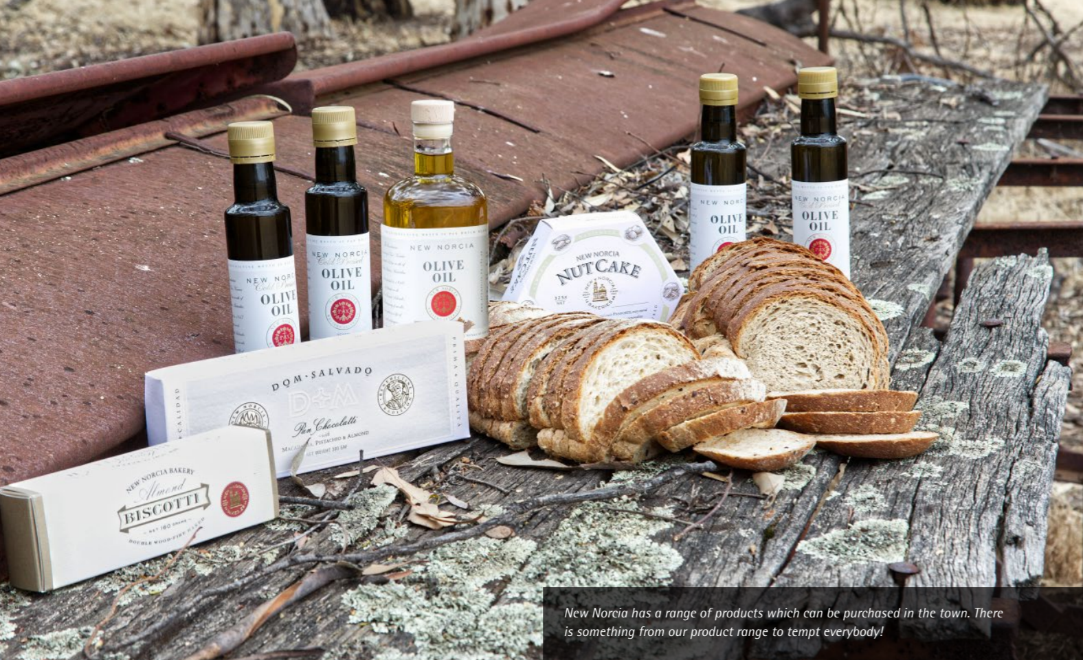
New Norcia has a range of products which can be purchased in the town. There is something from our product range to tempt everybody!