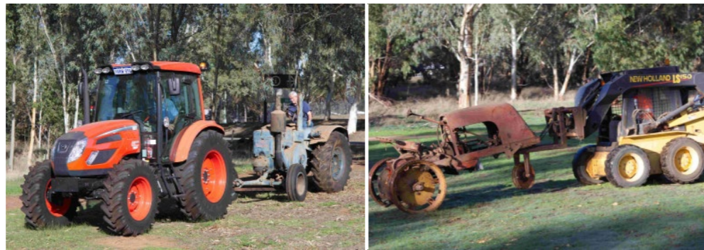
The new tractor towing the old Lanz Bulldog tractor.

We had a greeting from Abbot John as we passed the admin office with the beautiful old horse drawn cart (in this case – fork lift pushed cart!)