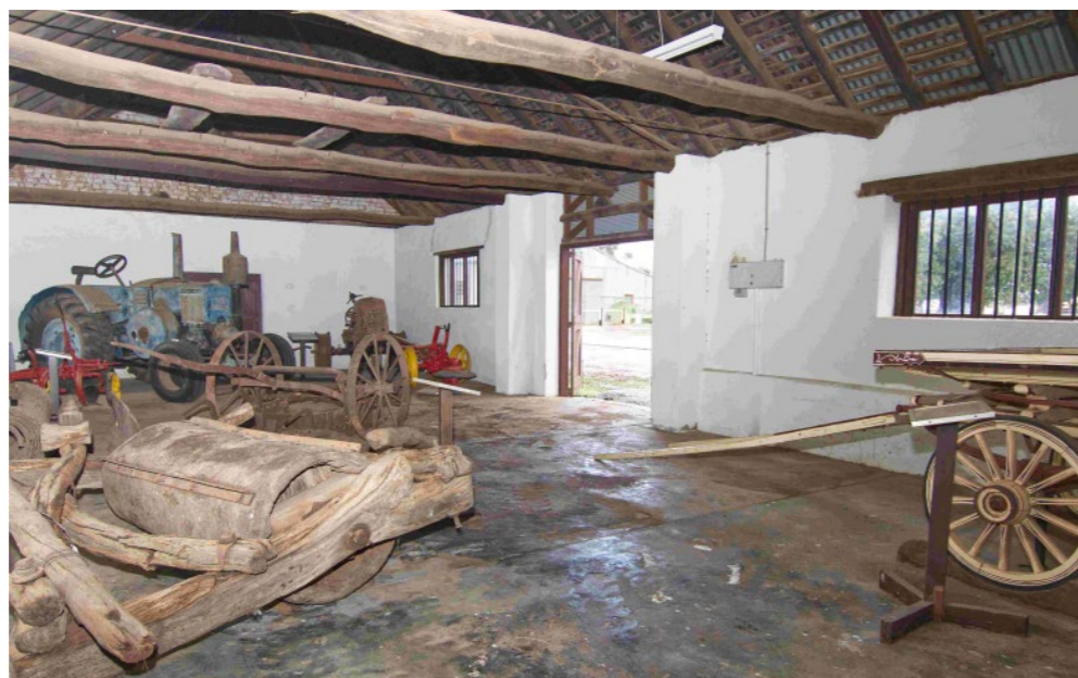
Pictured above is the majority of the farm collection in place in the Blacksmith's shop.