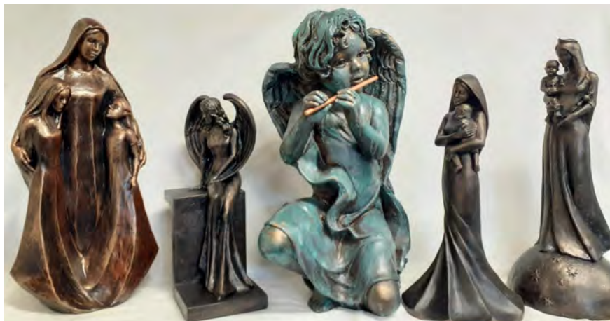
L-R: Mary and Girls, Angel of Love, Angel, Dancing Madonna, Our Lady Help of Christians.