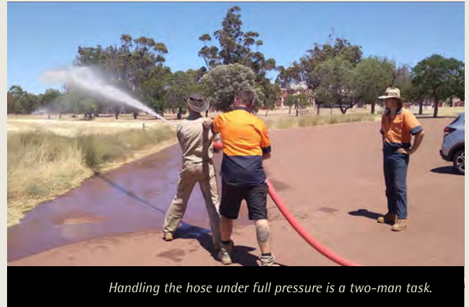
Handling the hose under full pressure is a two-man task.