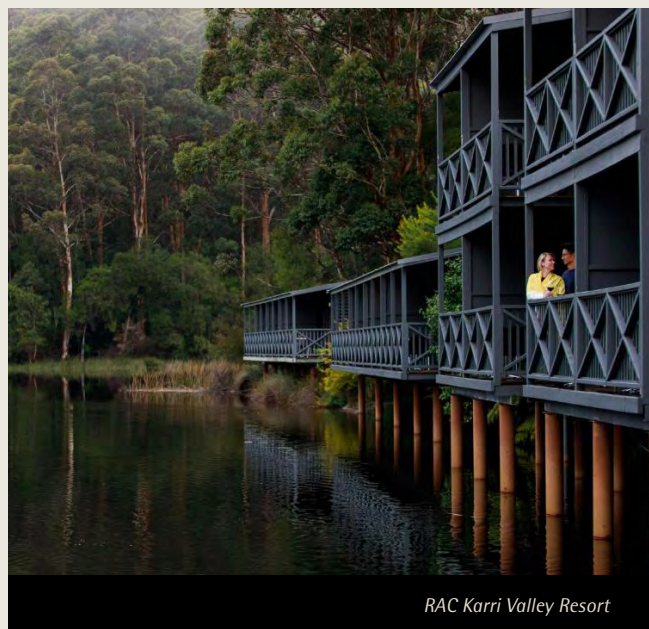
RAC Karri Valley Resort

Scan the QR code to vote, or visit toptourismtownwa.com.au Voting closes 5pm, May 22.