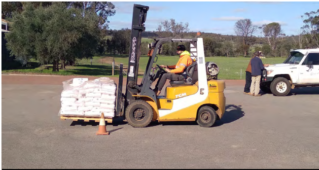
Grounds and Maintenance staff completing lift course held onsite.