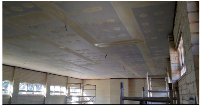
Painting of the new ceiling completed by Colourwest Painting.

June has been a busy month for the Grounds and Maintenance Department. The team has installed updated signage and increased mowing and gardening efforts as the site has begun to turn green. They have also been repairing damaged water lines. In addition, the Grounds and Maintenance staff have completed a two-day forklift course held onsite and conducted by CR Tafe Northam. Each day continues to bring a variety of work requests.