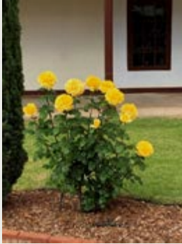
Spring roses, monastery central cloister, 2025