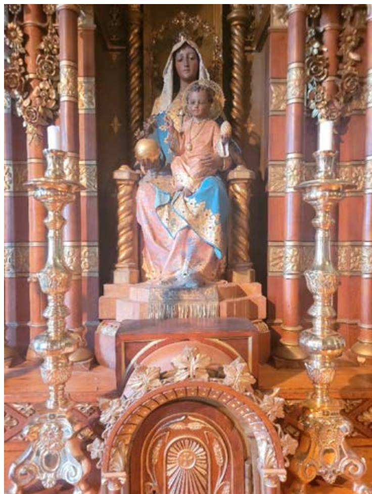
Photo: Oratory, Holy Trinity Abbey, New Norcia, 2025.

Feliz Navidad / Bon Nadal / Boas Festas / Bones Festes / Buon Natale / Joyeux Noël / Frohe Weihnachten / Feliz Natal!