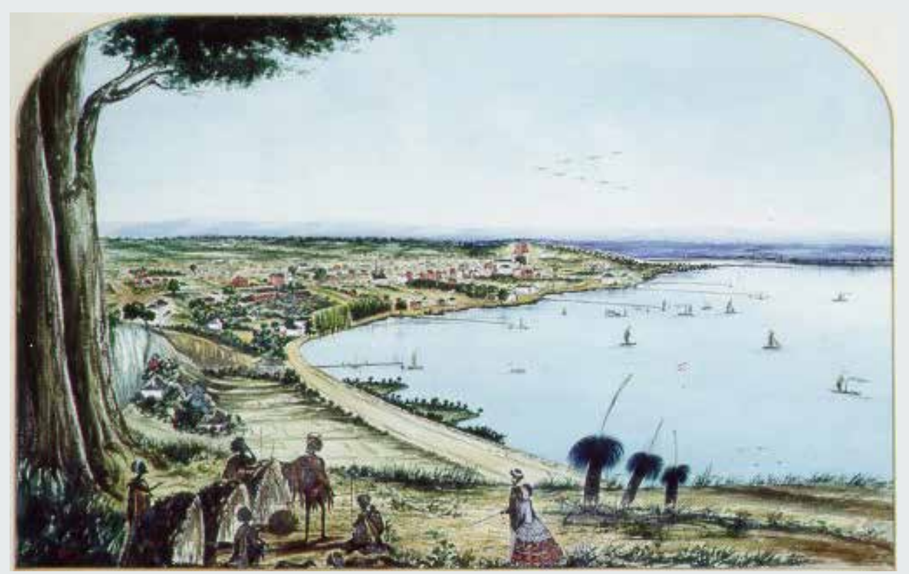
'View of Perth from Mt Eliza' 1864 by James Walsh (Watercolour 60 x 82 cm)