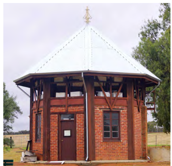
New Norcia's apiary