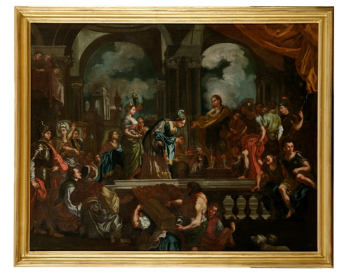
Barak and the Queen of Sheba by a Follower of Solimena cC18th 1975.823

17<sup>th</sup> and 18<sup>th</sup> centuries originally placed around the Monastery, Church and Colleges as objects of inspiration and devotion. There are over 160 contemporary