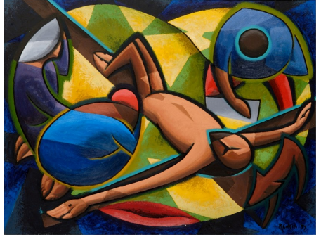
Weaver Hawkins Golgotha Scene 195 New Norcia Collection 2007.29

IMPORTANT CONVERSATIONS: Significant religious artworks from New Norcia's contemporary collection This exhibition features contemporary Australian artworks inspired by the Christian narrative. The works date from the 1930s to the present day. For most of the artists – believers or not – traditional Western religious art seems to have imprinted on them a powerful iconography for dealing with the central issues of human life. Australian Gallery (1<sup>st</sup> floor to the right)