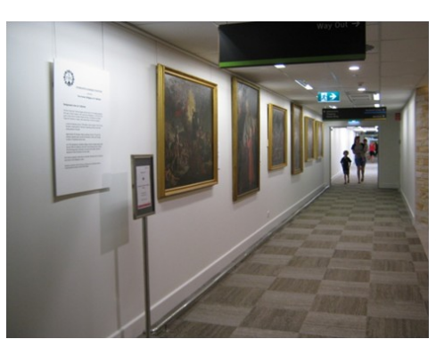
Paintings on display at St John of God Hospital Murdoch

Today the Collection is a large, multi-faceted body of artworks including; a small but important group of 19<sup>th</sup> century works-on-paper of New Norcia, the place, commissioned by Salvado for reporting, promotion and fund-raising purposes in Europe, and approximately 60 European religious paintings from the