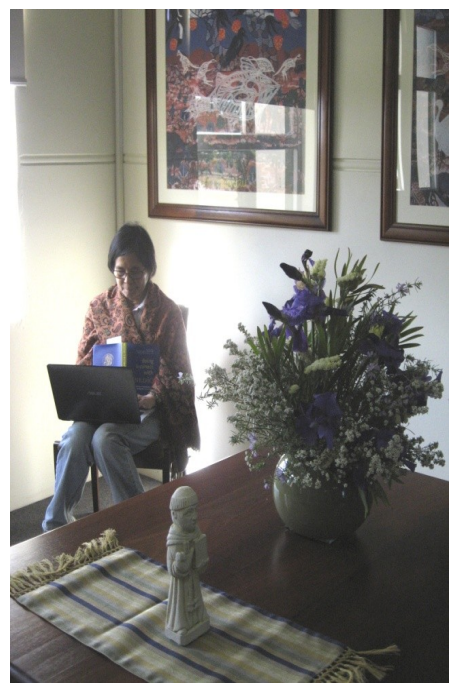
Student reading in the Institute classroom