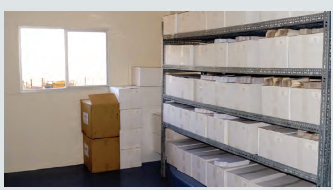
The new bakery packing room