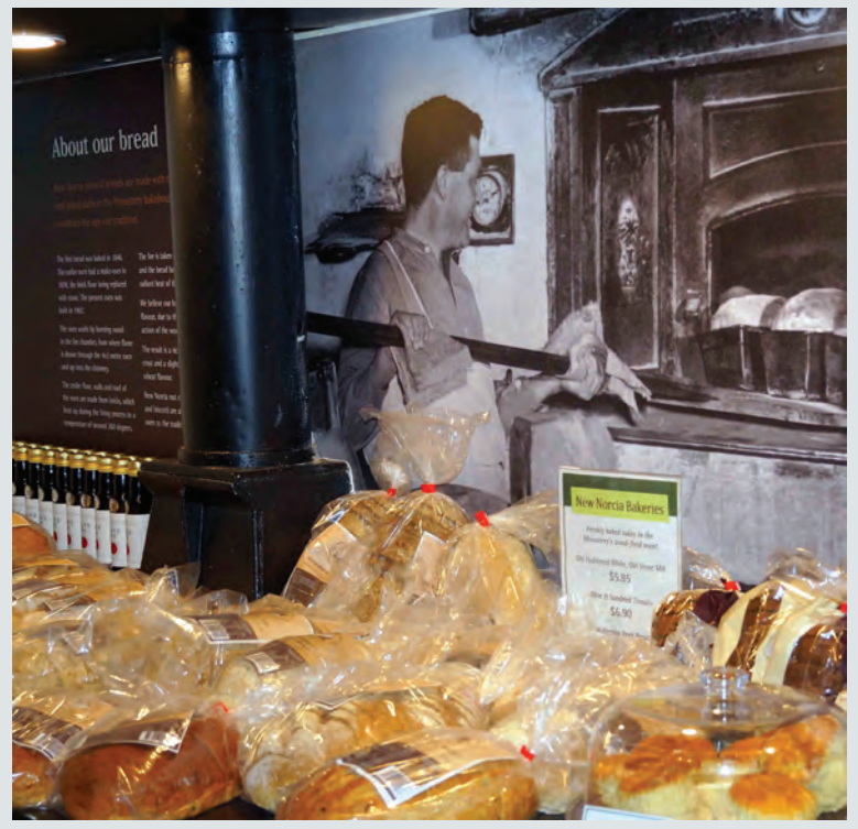
Fresh bread for sale at the Museum & Art Gallery, and also available at the Roadhouse.