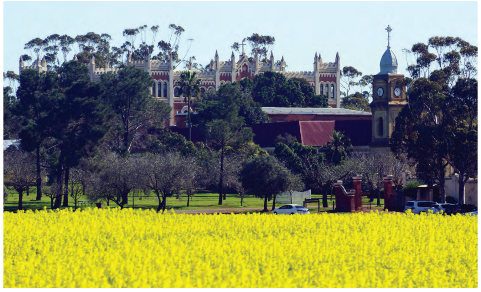
Canola in full bloom is providing a spectacular drive to New Norcia and backdrop around the town.