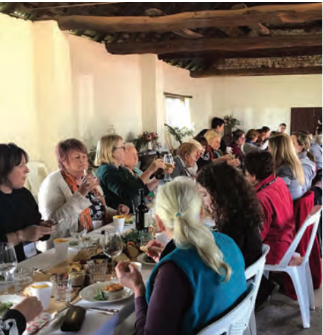
Lunch in the Blacksmith's Shop