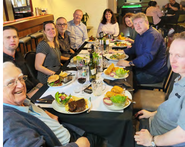
The group enjoying lunch at the Bolgart Hotel

It is our custom to conclude this time of retreat with a picnic day. This year, it took the form of Sunday lunch at the revamped Bolgart Hotel. We were pleased to invite the little group who provided music ministry at Mass to join us. We enjoyed a lovely meal, good wine, and broke the week-long silence with great conversation.