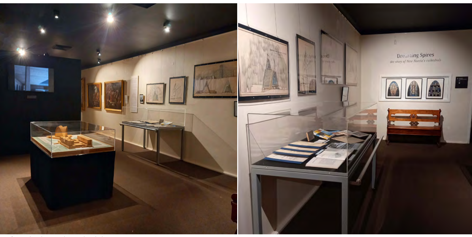
Left & Right: photo credit to Vida Whale