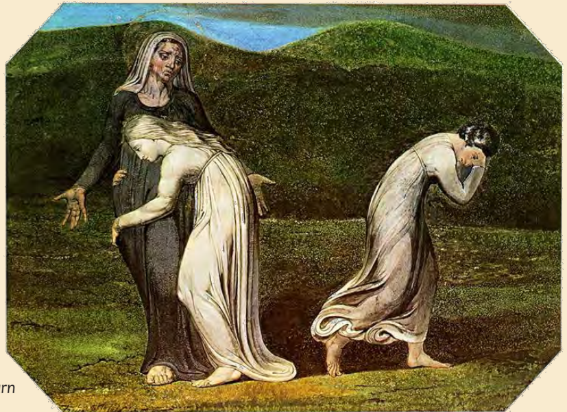
Naomi entreating Ruth and Orpah to return to the land of Moab, William Blake, 1795

Women of all Christian denominations are welcome to join the women of New Norcia parish for a day of fellowship, reflection and prayer, where we will explore the lives of three inspiring women in the Book of Ruth – Naomi, Ruth and Orpah.