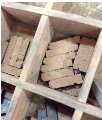
BEFORE – dusty and indistinguishable