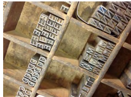
AFTER – Sparkly and spectacular