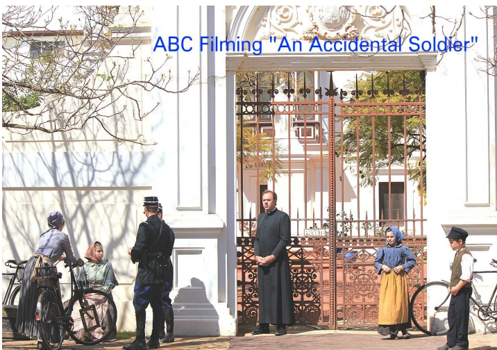
ABC Filming "An Accidental Soldier"