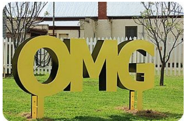
Above image: Artist: Lucy Vader Title: OMG "Oh My God".

The Sacred in 3D - Sculpture at New Norcia will be at the New Norcia Museum and Art Gallery from September 22 nd 2012 - April 2013.