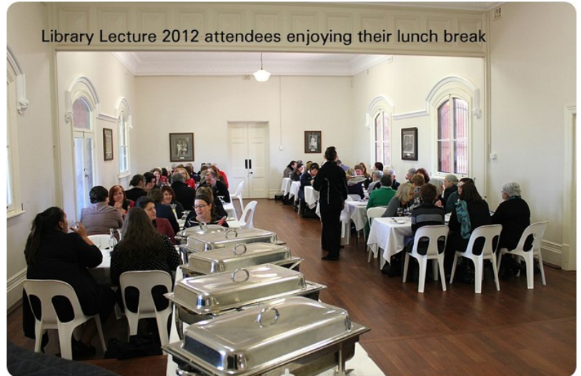
Library Lecture 2012 attendees enjoying their lunch break